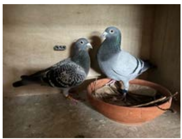
1<sup>st</sup> Section J

We would like to say well done to all the winners and everyone on a hard race. Well done on a top performance from a top hen.