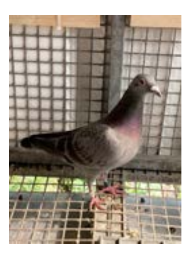
One of the crack race team of G Treharne and Son